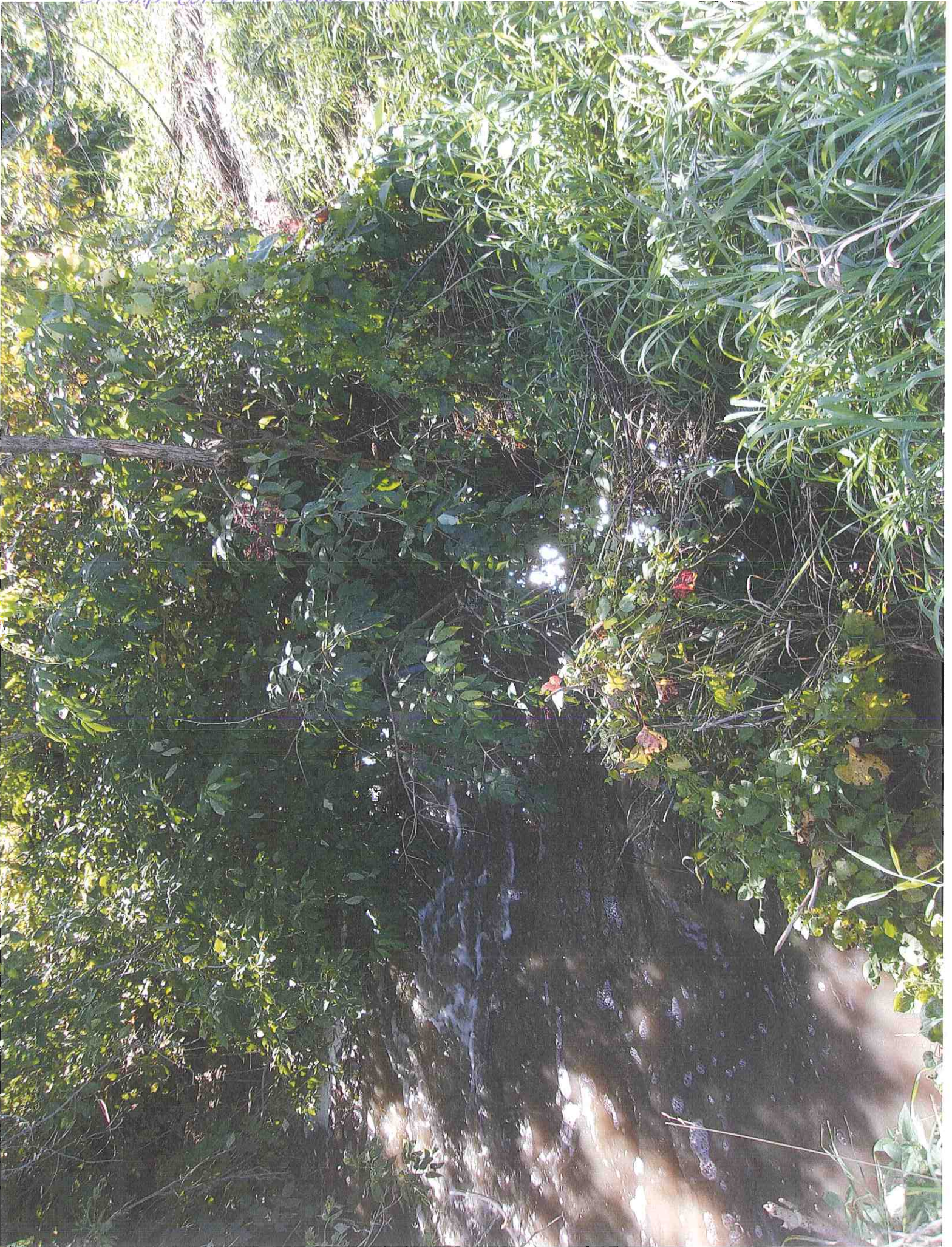
29" Camp Cutline to BEAVER CREEK